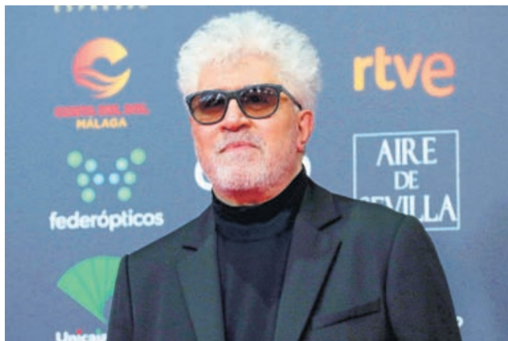
Spanish film director Pedro Almodóvar poses for photographers at the red carpet ahead the Goya Film Awards Ceremony in Malaga, southern Spain, Saturday, Jan. 25, 2020.